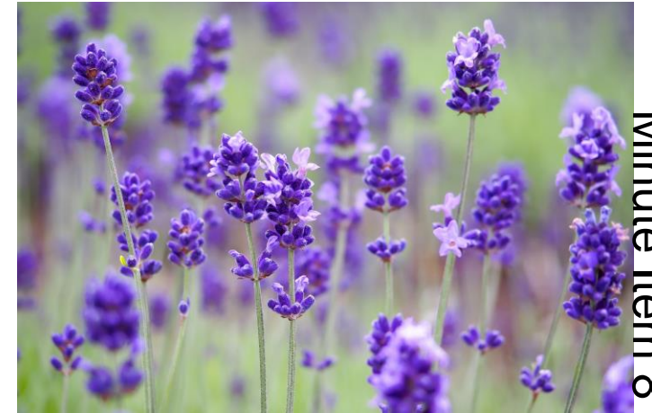
Minute Item 8